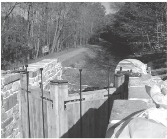
In November 2014, two massive wooden miter gates were installed at the lower end of the newly reconstructed Lock 2 East at Wharton.