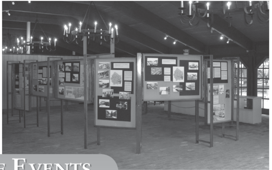
As seen here, the traveling exhibit has spent several recent summers on display to hundreds of visitors at Waterloo Village.

This year the exhibit is getting a facelift, with new titles and art work, before going on display at Macculloch Hall Historical Museum in Morristown from March until October. ■