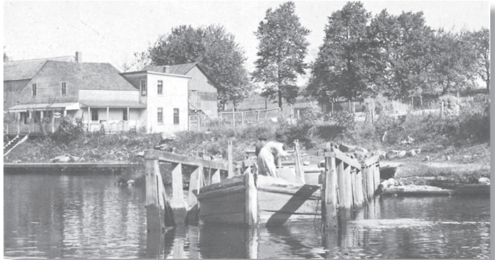
This canal boat has entered the cradle car in the basin at the top of Shippenport's Plane 1 East. The buildings in the background are part of the community that developed at the head of the plane.

ogize if we sometimes fall short in our reporting. Just listing all the projects and plans is becoming an arduous task. Although this may seem to be a good problem, it is the informed support