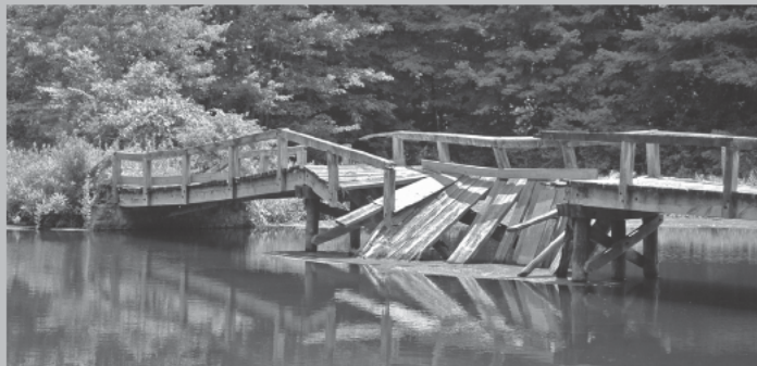
The Waterloo mule bridge in 2007, just as it began to deteriorate.